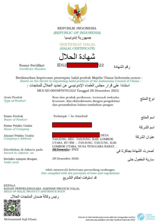
Figure 5. Example of the New Halal Certificate