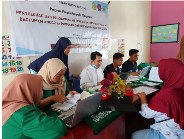
Figure 4. HPP assistance activity

The second activity was the HPP assistance. In this activity, MSEs were directly guided to fill in some forms to get Taxpayer Identification Number (TIN) and Business Licence (BL) ID which are needed for completing the halal registration. Figure 4 illustrates the documentation of HPP support activities.